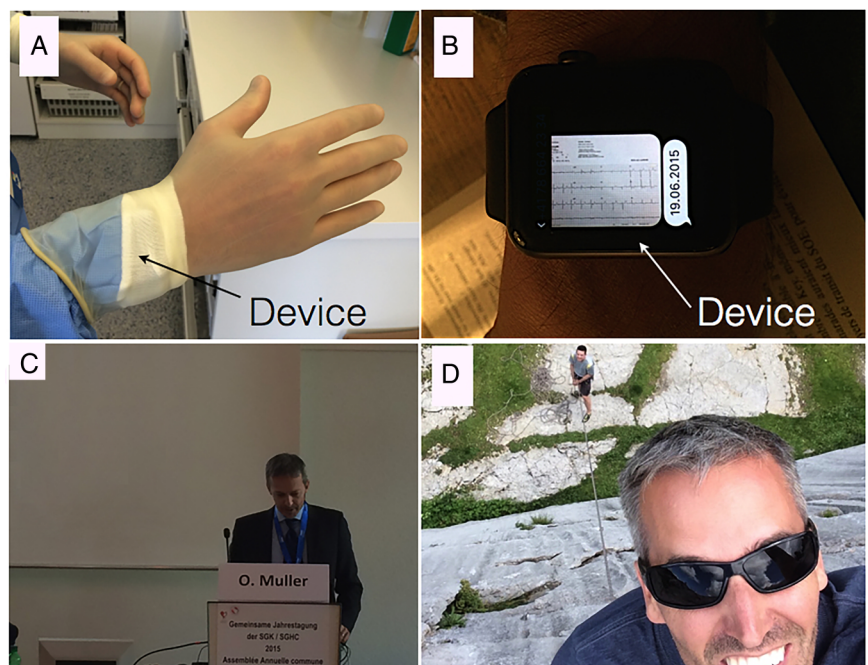
Figure 1 Examples of recordings in an Interventional Cardiologist's Activities in Daily Life (ICADLs). (A) Cardiac interventions: the footprint of the device (arrow) is visible in the sterile shirt (a sterile glove covering it). (B–D) The device is worn on the wrist during 'on-call' and other activities (here, giving lectures or rock climbing).

The device showed minimal physical activity during cardiac procedures, so any increase in HR must have been triggered by mental stress. It appears that the HR increase is inversely proportional to age: operators <45 years had a fivefold to eightfold greater HR increase compared with those >60 years. One possible hypothesis is therefore that mental stress decreases with age and/or experience.